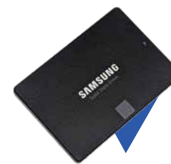
SSD Backup for DVR