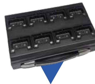
8 Bay Docking Station