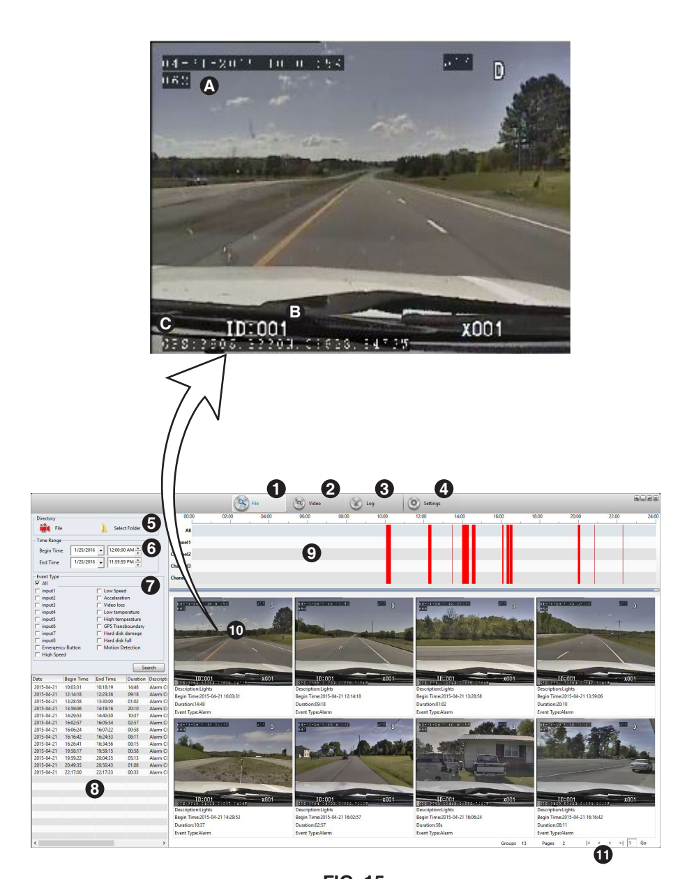
FIG. 15 Software Player